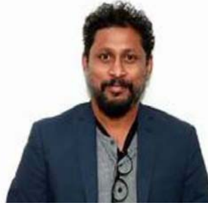
Shoojit Sircar, Film Director

Shoojit Sircar was born into a Bengali Hindu family in Barrackpore, some 30 km from Kolkata. He completed his schooling from Kendriya Vidyalaya, Barrackpore in the year 1985 and then he went on to Shaheed Bhagat Singh College, University of Delhi for higher studies.